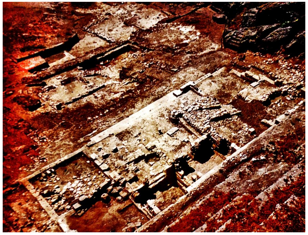
Fig. 2 Sanctuary of Palici - excavations 1995 (MANISCALCO, 2008, p. 17)

The Palici, according to Maniscaldo (2008, p. 132) is a catalyst of syntheleia of the Sikels at the time that this was an important place of worship of the indigenous population since remote times and the heart of the Sikel territory in Sicily.