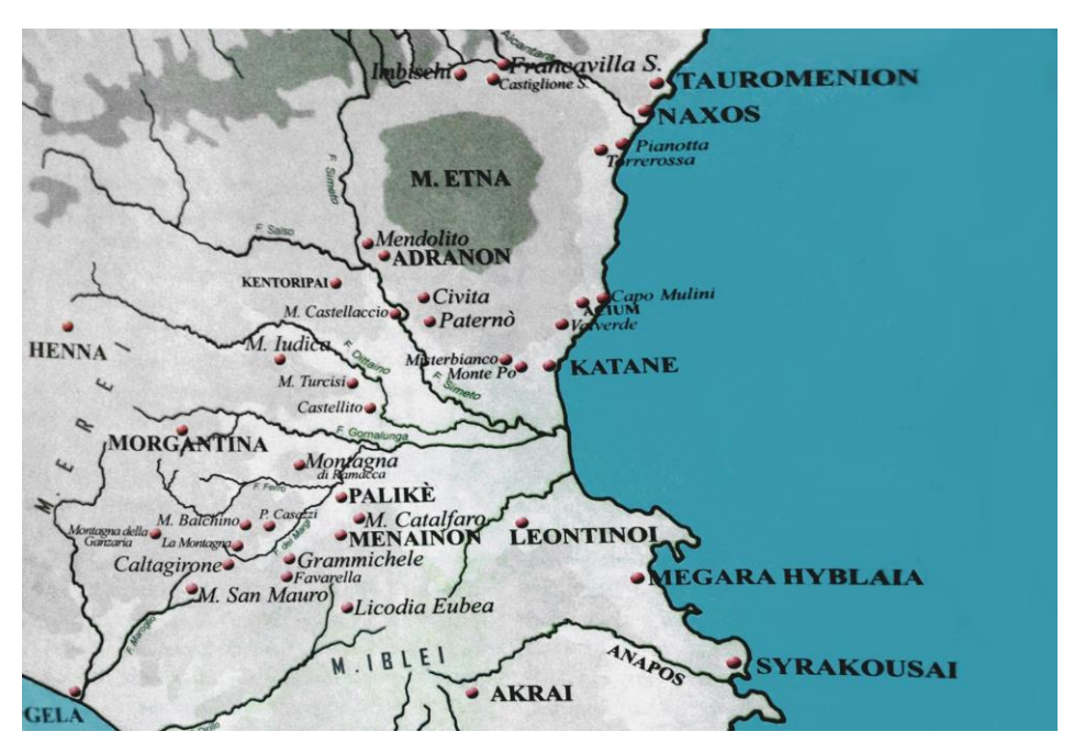
Fig. 1 Map of distribution of the site. (MANISCALCO, 2008, p.14)

Ducetius led and consolidated his powers in synteleia, which would also have had a religious connotation (JACKMAN, 2006, p.35). Diodorus describes in details the saga of Ducetius and the improvements that took place at the important shrine of Palici, as well the founding of the city of Palike around this religious center, the sanctuary of Palici (Fig.1).