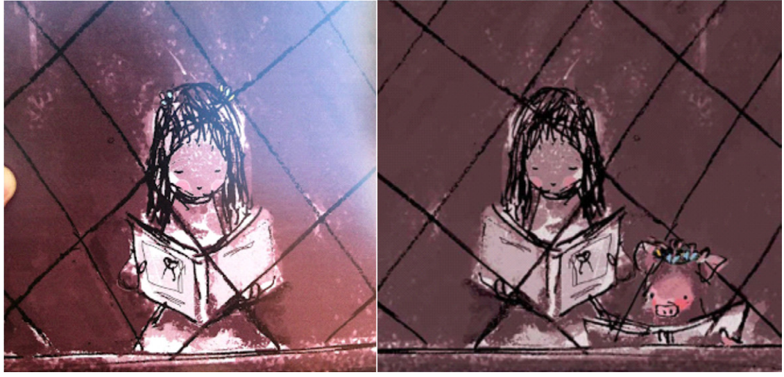
Figure 3: Front and back endpapers of the book "Adélia"

JEVA; SCOTT, 2011). In the initial cover sheet of the work Adélia , we find only the girl reading a book, while the final cover complements with the main character, the pig and the two of them reading a book.