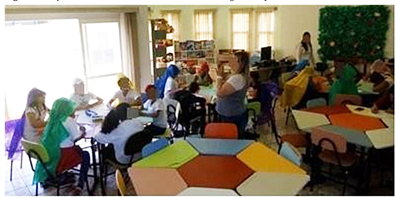
Figure 13: Bip in the "several versions of the little red riding hood" cycle

Once the activities were over, the children were free to enjoy the BIP's book collection, always under the guidance of the storytellers who pointed books, helped them read, and influenced the children's contact with books and literature.