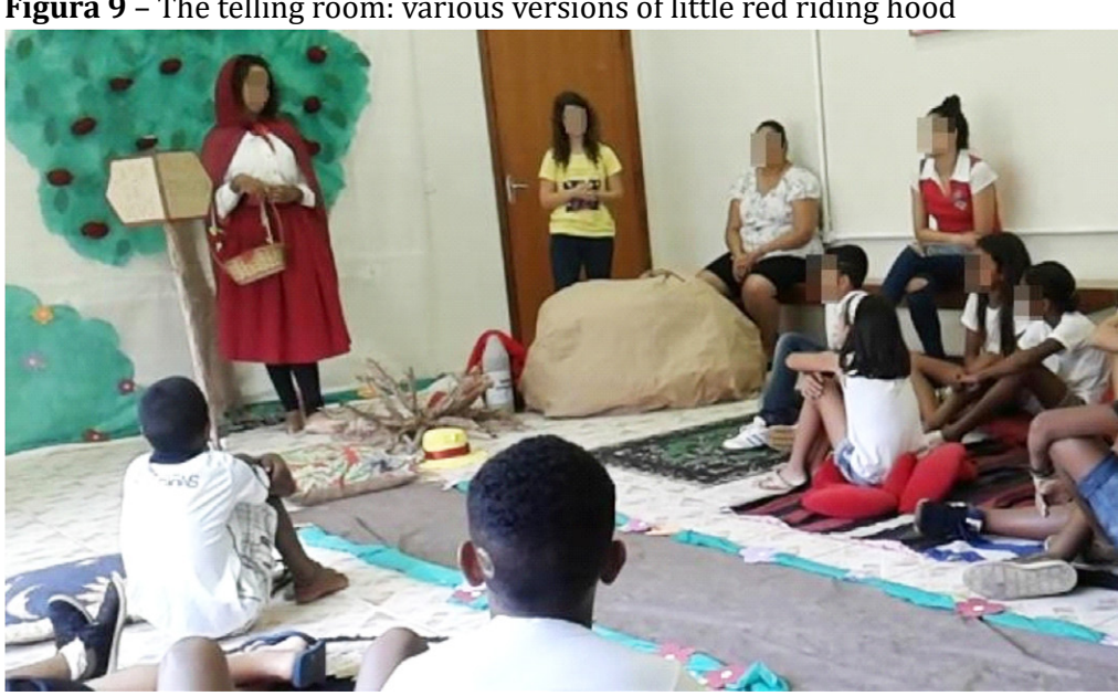
Figura 9 - The telling room: various versions of little red riding hood

When readers visualize, they are constructing meanings by creating mental images, because they create scenarios and figures in their minds while they read, raising the level of interest and thus keeping their attention (GIROTTO, SOUZA, 2010, p. 85).