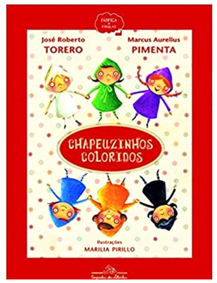
Figure 12: Little colored hatchet book

the book Chapeuzinhos Coloridos (TORERO, PIMENTA, 2016), a book of tales in which there is a different story for each Little Riding Hood, as we can see in the pictures below: Little Black Riding Hood and Little Green Riding Hood.