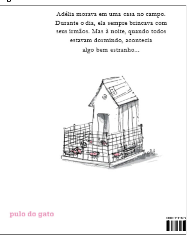
Figure 2: Back cover of the book "Adélia"

From this questioning the librarian started to explore the back cover, which still does not answer the initial question and the ambiguity is reinforced by the color of the little pigs. There is already a perspective on the reality of the animal/pig in the text. But the question remains: Who is Adelia? At this point the librarian wanted to know if any student would make the relationship between the color of the little pigs and the title of the story.