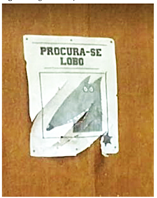
Figure 7: Sign at CELLIJ