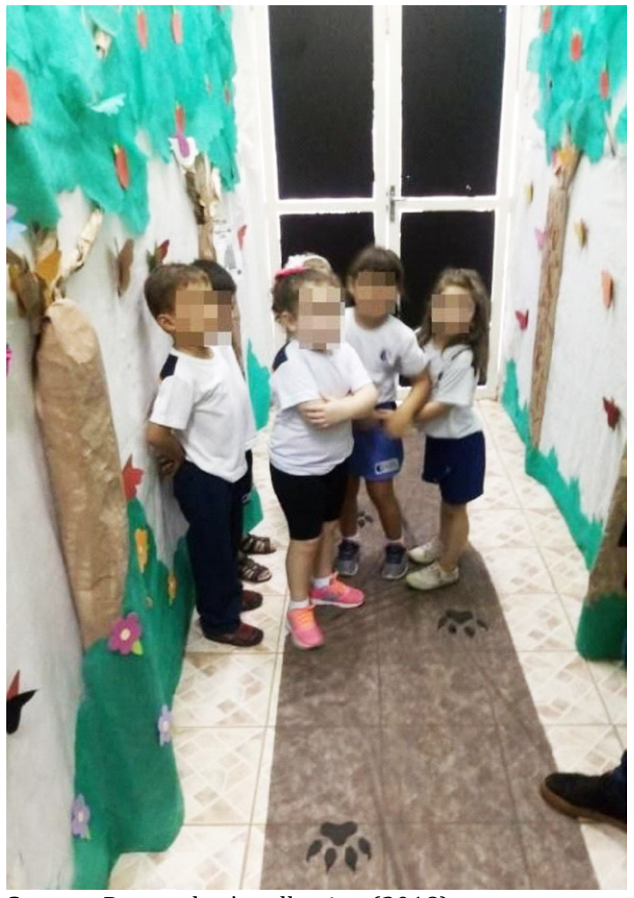
Figure 8: Inference corridor cycle "several versions of little red riding hood".

does this place look like?", "What do these footprints look like?", "What stories do you know that have a wolf?", "Are these the stories you are going to hear?" What do you think?"