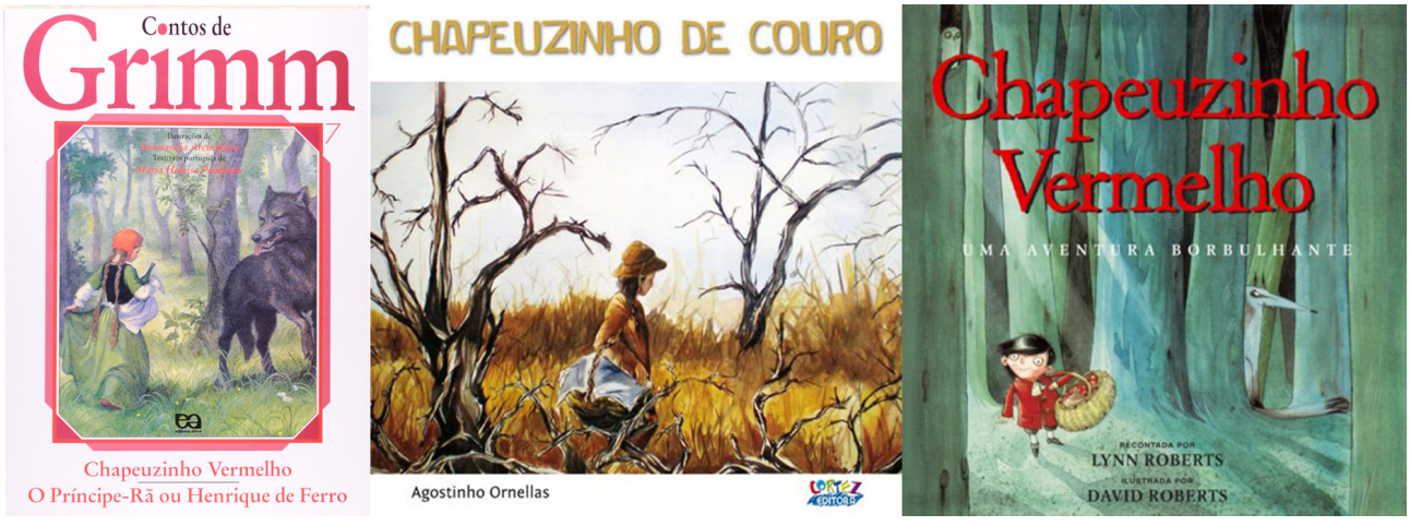
Figure 11: Featured titles on the bookshelf

Source: GRIMM (1997); ORNELLAS (2013), ROBERTS (2009)