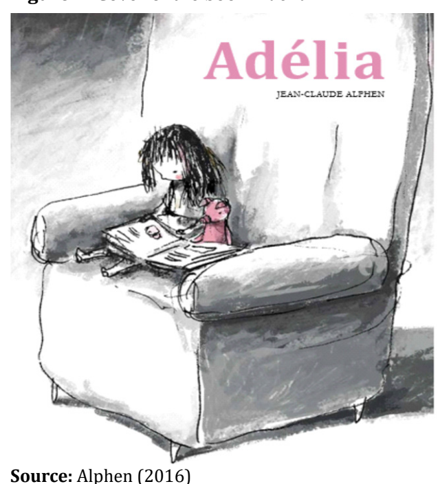
Figure 1: Cover of the book "Adélia"

The librarian started the activity by presenting the book and its the cover, because it is, along with the title, the first contact with the work, "which can seduce or not to read, attracting attention and inviting the reader to enter the universe that the book comprises" (RAMOS; PANOZZO, 2011, p. 76).