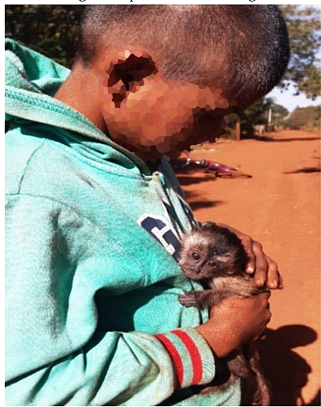
Figure 5 – Child playing with a baby monkey found in forest fragments present in the village