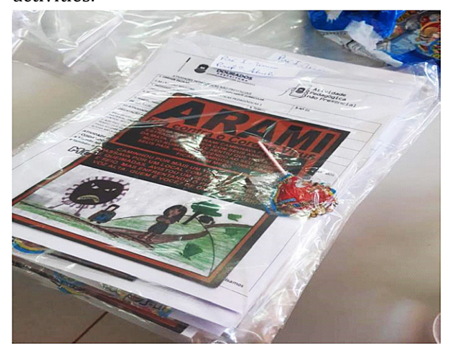
Figure 6 – Kit of non-face-to-face pedagogical activities.

nous Language), which were given to parents of children and adolescents so that they could continue school activities at home (Figure 6).