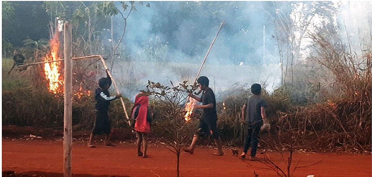
Figure 2 - Guarani and Kaiowá children putting out fire in the Dourados Indigenous Reserve.

Indigenous Reserve has been affected and degraded by the proximity to the urban center of the city of Dourados. There are facts that show how necessary action is, and often it will be the children who will participate, to advance or to acquire their rights. Figure 2 shows a fire in the Jaguapiru Village and the action of children, who with great courage went to put out the fire so that it did not reach the adjacent woods. What is exciting is that the Guarani and Kaiowá indigenous children were not paralyzed by the fear of flames, but understanding the harm that the fire would do to the village, they organized themselves as possible to put out the fire. In situations like this, children act with an instinct to defend the preservation of life on Earth, characterized in their ancestry.