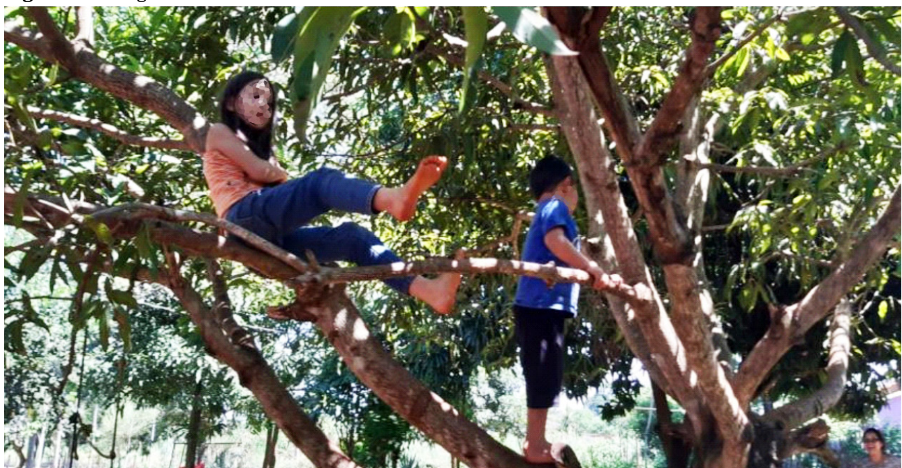
Figure 3 - Indigenous children on trees

from nature, do not need to be kept, cleaned, conserved, disputed" (NOAL, 2006, p. 16).