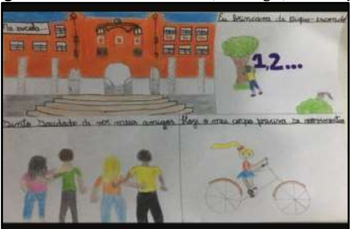
Figure 1 - Narrative about school, nostalgia, and body.