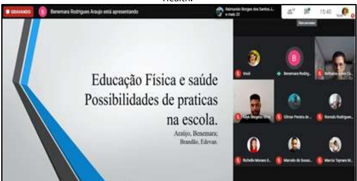
Figure 6 – Record of Pibid intervention with the theme Physical Education and Health.

To enable greater student interaction with the theme of mental, social, and bodily health, Pibid/UFT scholarship holder who worked with high school classes produced support materials that thematized health from the body practice of Gymnastics. This experience was subsidized by the production of audiovisual materials in the form of slides, videos, blogs, and podcasts, which were disseminated by PE/UFT radio. However, we have yet to receive feedback on the impact of these activities on school students. Figure 6 records one of Pibid's remote interventions with High School students based on knowledge learned about Physical Education and Health with the teacher of CPII/RJ.