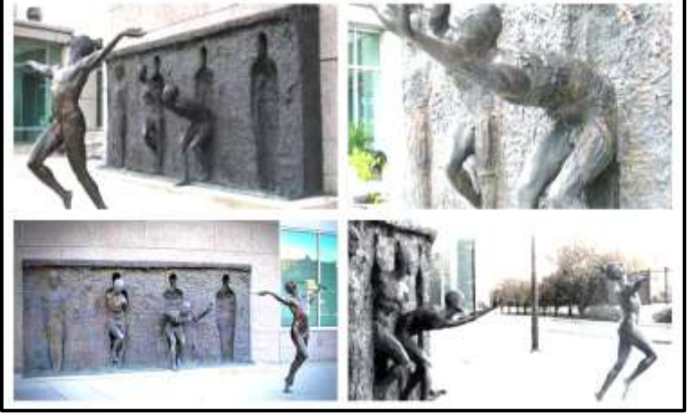
Figure 4 – Composition of the work Libertad by the sculptor Zenós Frudakis.