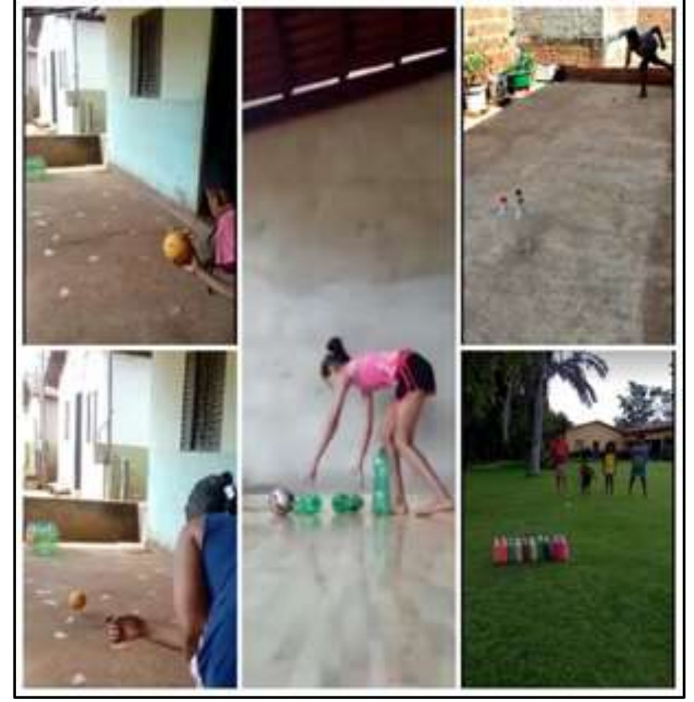
Figure 3 – Records of feedback from children trying bowling at home.

[...] We improved the study scripts so that we could increasingly give our students meaningful knowledge. [...] We looked for ways to adapt the language of writing, [...] and we started to put inviting phrases [...]. Because of the adaptations to better mediate knowledge [...], we realized advances [...] with the students because they started to return the scripts [...] and began to produce the videos performing the practical activities [...] (NARRATIVE, Pibid/EF/UFT scholarship holder).