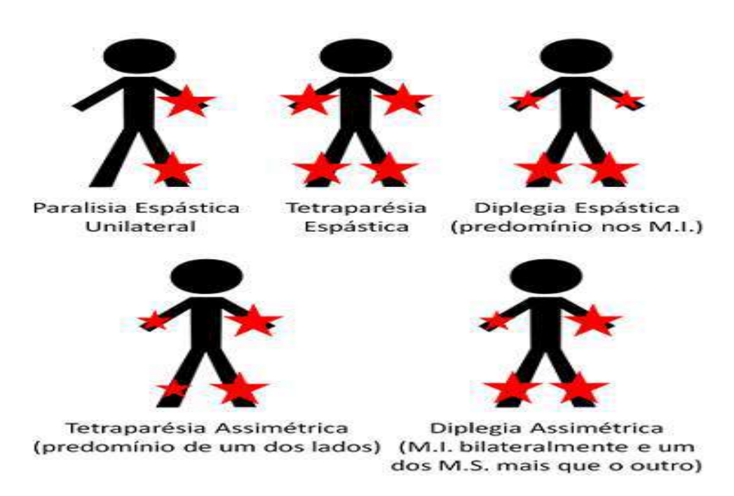
Figure 1 : Classification of Cerebral Palsy, according to location and neurological severity.

By observing Figure 1, we see the classification of CP: the top three are classified as spastic paralysis, each referring to the amount of limbs affected and their level of impairment. According to Gianni (2010) the subject who has spastic paralysis will have a delay in his motor development "due to muscular hypertonia and spasticity, because of the spinal cortex pathways lesion" (GIANNI, 2010, p.15). The last two are classified as asymmetric, affecting the individual's entire body, however, the intensity of the impairment varies from one limb to the other.